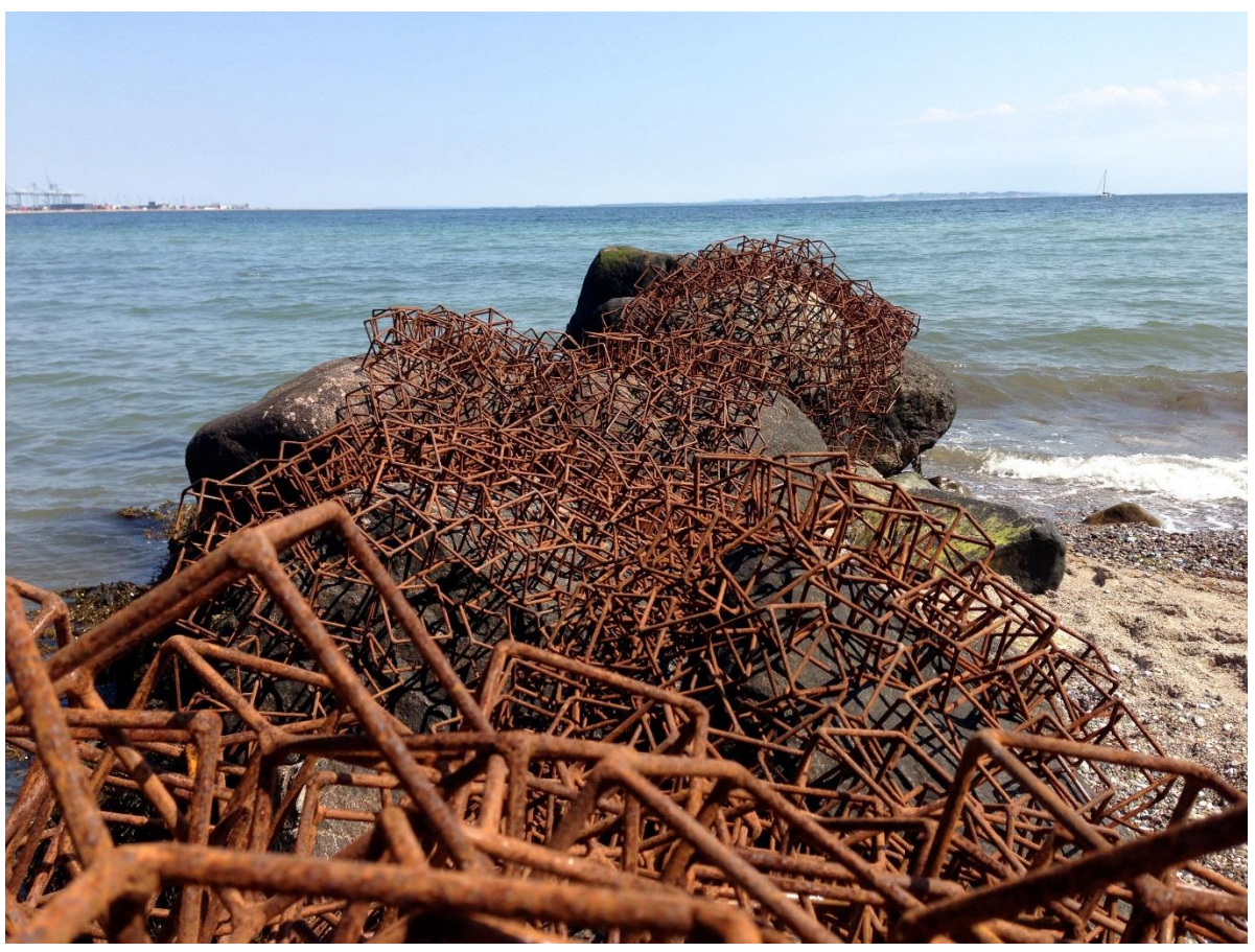
Jennifer Cochrane, Cube Stack 2, 2013, Aarhus, Denmark. Steel, variable dimensions.