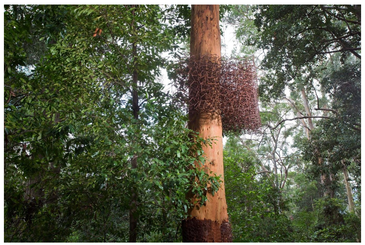
Jennifer Cochrane, Steel Stack with tree, 2015. Steel.