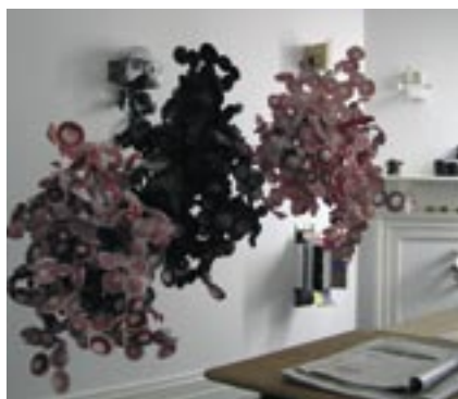
Carol Wells OCH studio

Artsourced studios were open to the public again in 2007 as part of Artopia: Living Artists WA. Sketchpo, an exhibition of sketches, at the Blinco Street studios attracted over 500 people; around 400 people wandered through the Old Customs House studios; and around 50 people enjoyed the hospitality and art on display at Settlers Cottage. The open studio events are a fantastic opportunity to showcase artists' working spaces and continue to be warmly received by the public.