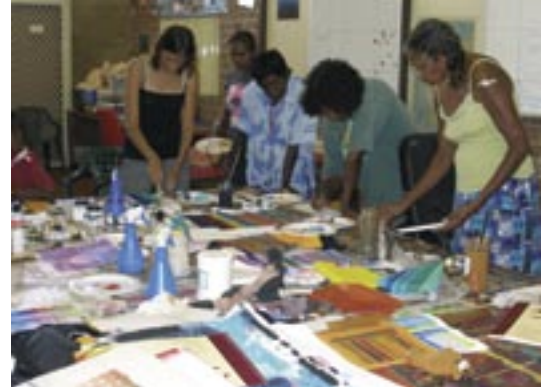
Pilbara skills development workshop at Yinjaa Barni Art Centre