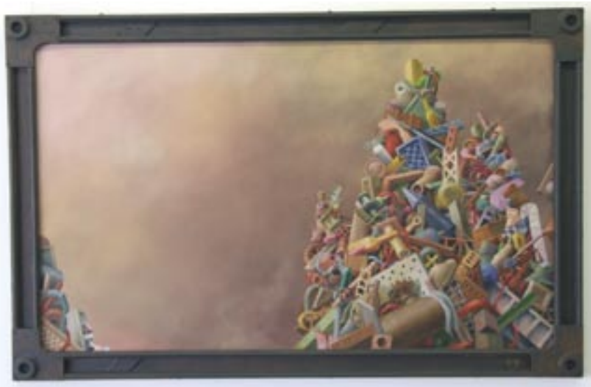
Artist: Stuart Elliott, Mountain 2006 , Oil and acrylic on plywood panel, 1060 x 1660 mm

Artsource engaged in coordinating public art projects and engaged local government officers in the championing of appropriate processes.