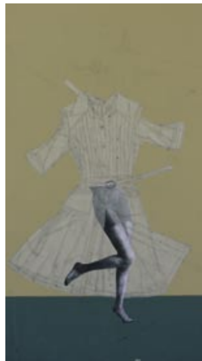
Artist: Shaaron Du Bignon, Pintuck Trench , Life size Temporary Installation, King Street