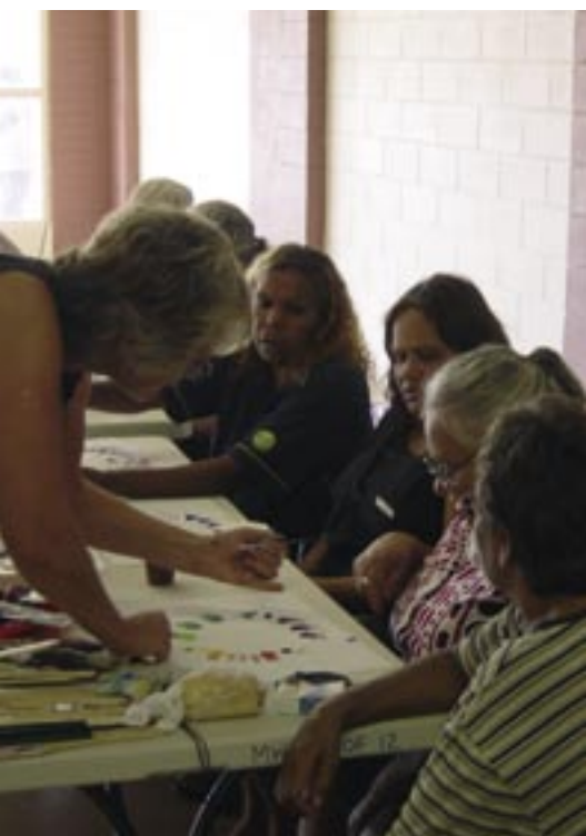
Lesley Munro Mullewa workshop.