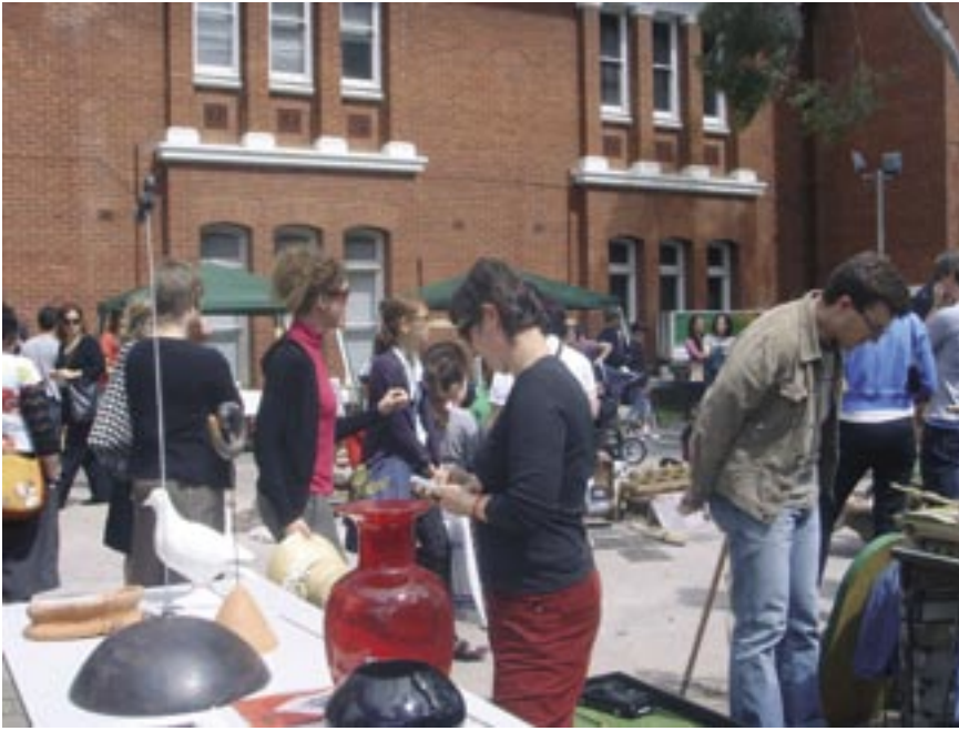
PICA Car Boot Sale

were kept alive and interest from artists was sustained in the period between festivals. Artopia received $65,000 from the Department of Culture & the Arts and local government support from the City of Perth, $30,000, and the City of Fremantle, $4,000.