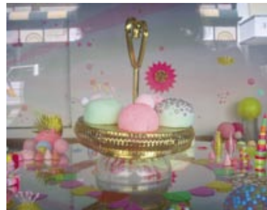
Pip n Pop installation at ClubX