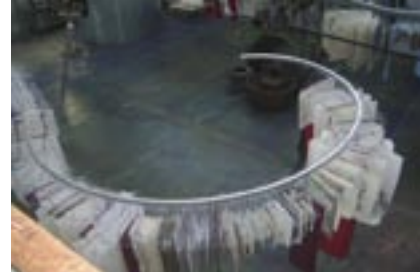
Sketchpo at Blinco Street studios