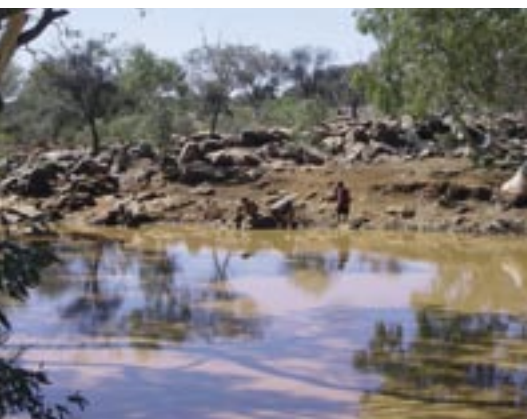
Wiluna dyeing workshop

These are challenging positions; they are remote from other organisational support and the part time nature of the jobs in a robust employment market presents people with almost impossible lures. By the end of 2007, both Ashley and Hazel had moved on to other opportunities. We made the decision to focus attention more closely in the Mid West, allowing Sonja more opportunities to grow the potential of the sector.