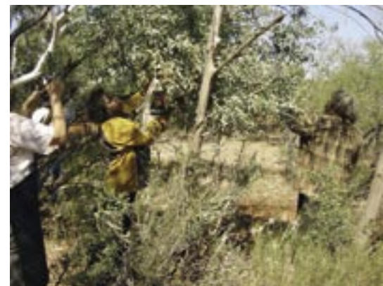
Wiluna gathering dye material

The Regional & Indigenous Program has always been reliant on project funding, and in 2007 we were fortunate to continue the partnership arrangements with support from the Department of Culture and the Arts, Department of Transport and Regional Services, Western Australian Regional Initiatives Scheme, Pilbara Iron, Rio Tinto, Healthway, Relationships Australia and Country Arts WA through the Australian Government's regional arts program, the Regional Arts Fund.