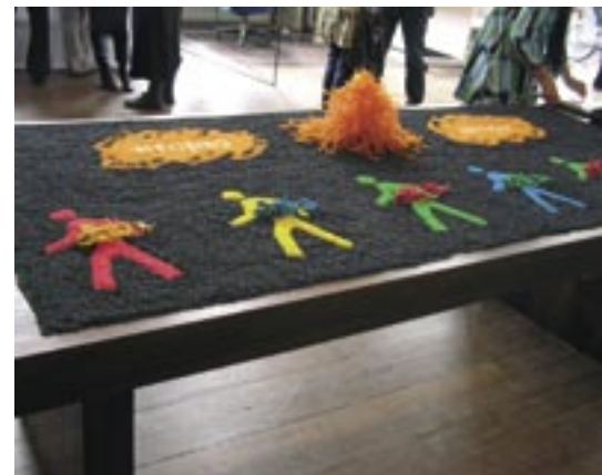
Bridget Waters Artopia Launch

9 Artists residencies in corporate offices and at mine sites