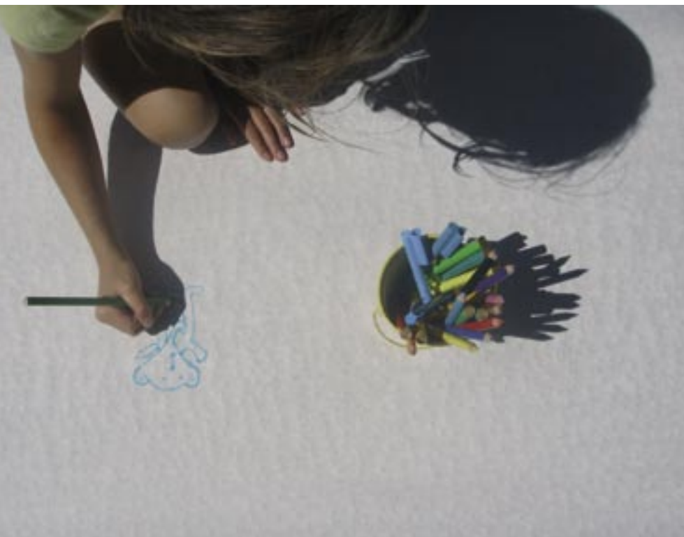
Big King St Draw

Artopia 2007 was administered through a partnership between artsource and the Association of Western Australian Art Galleries (AWAAG). Artsource developed internal systems for administering Artopia, and with assistance from an interim grant from the Department of Culture and the Arts, was able to ensure potential partnerships