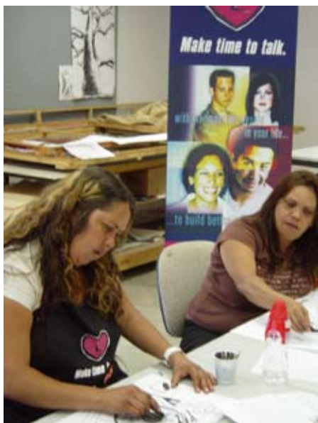
Artists at the Make Time to Talk Workshop in Katanning, 2006