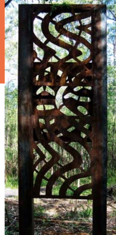
Artist: Peter Farmer

Our client numbers continue to increase rapidly, 28 new clients subscribing annually to access our services more than once; an increase of 38%. New Client Subscribers include 12 Art Gallery or Cafés, 7 art organisations, 5 Local Government Authorities, 2 schools and 2 services providers.