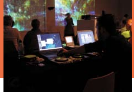
Light and Projection, Industry Night