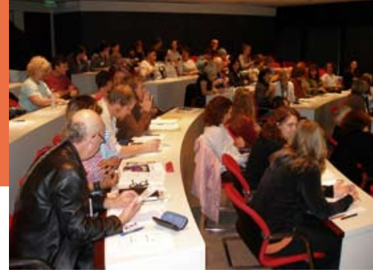
I am a small business, AbaF seminar

Members feedback about the type of workshops wanted resulted in an expanded program with attention paid to the quality and style of delivery. In addition to workshops about finding funds, presenting work to the public, photo documentation, tax and bookkeeping, we also ran several skills development workshops looking at issues of design development and materials. Our workshops for regional and Indigenous artists continue to grow, and the specialised content to be improved.