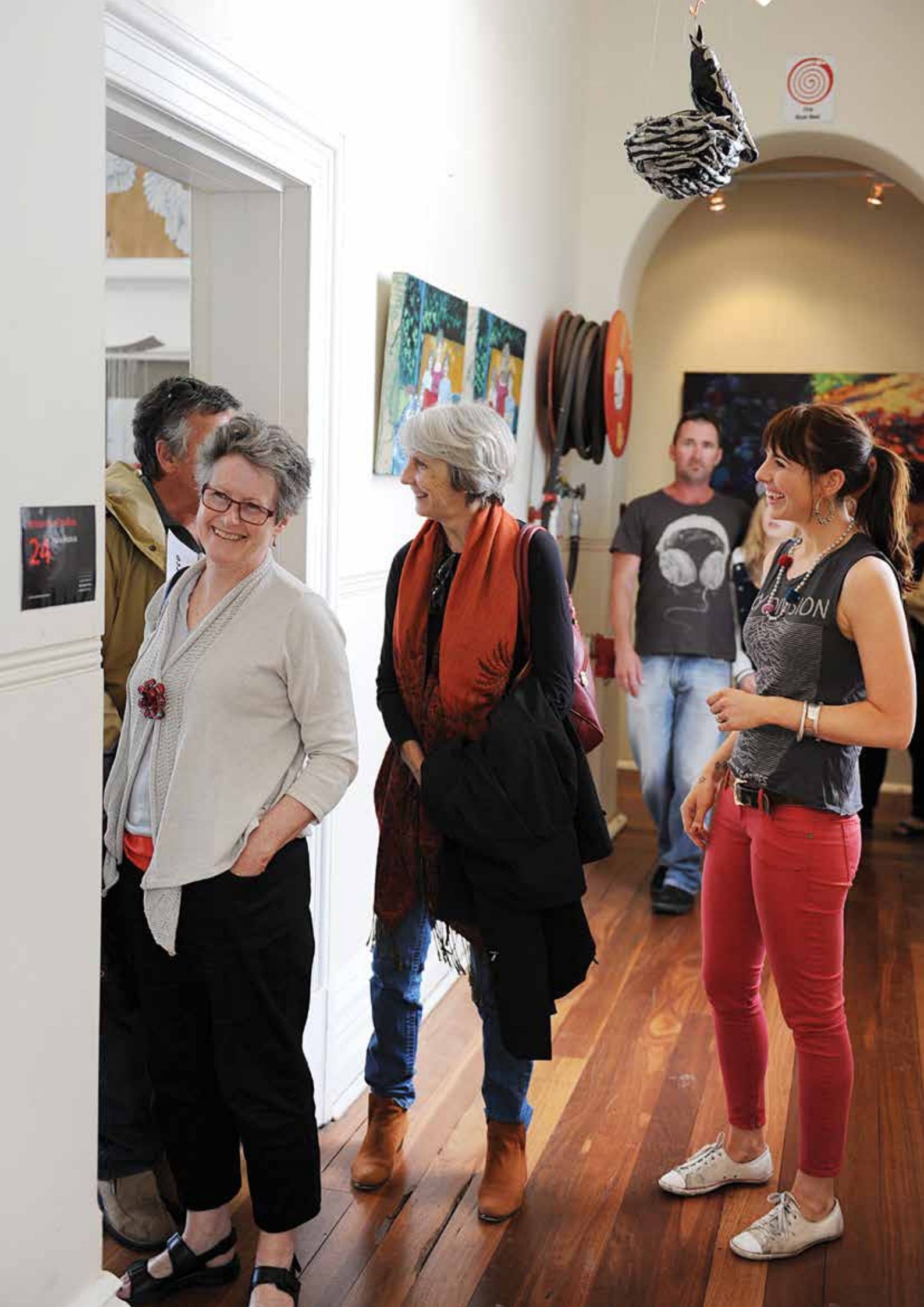
Above and opposite Artsource Fremantle and Midland Open Studios.