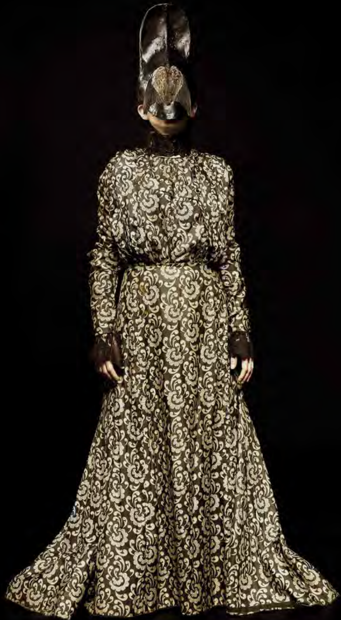
Opposite Thea Costantino, Ancestor I , 2012. Image: Thea Costantino.